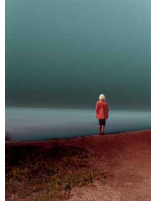
Photo emulsions cracked or peeling with age, fading ever so slowly from blacks into grays to complete white outs. The photographic fates hard at work. Serrated paper edges with dates in numbers. Polaroids streaked where the sealer missed. Hand-written scrawl on the backs of names you don't know. And then, there she was...

She wore a red coat, red shoes, a black skirt. Blond, like the women in detective novels or film noir shown on late night television sometimes. Her name printed by hand in the margin of the photo.