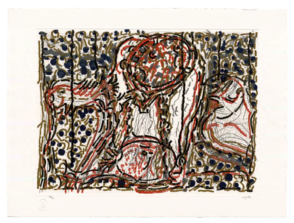
Figure 10: Honni soit qui mal y pense, 1987, color etching original print, image size 44,6 x 60cm, on Arches paper 56,2 x 75,5 cm, Atelier du Scarabée, Galerie Lelong Éditeur, Paris, Catalogue raisonné of Hibou Éditeurs archives.

Briet wanted to open his gallery featuring a print that Riopelle made for the opening called Honni Soit