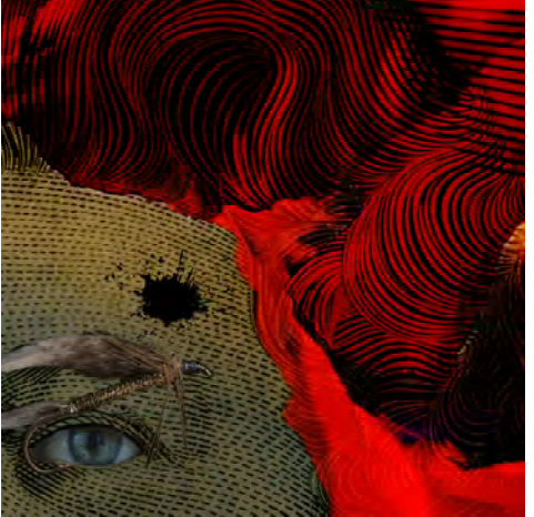
Figure 26: Coming out of sleep (après mouchetache), 2005 Digital Image: Bonnie Baxter